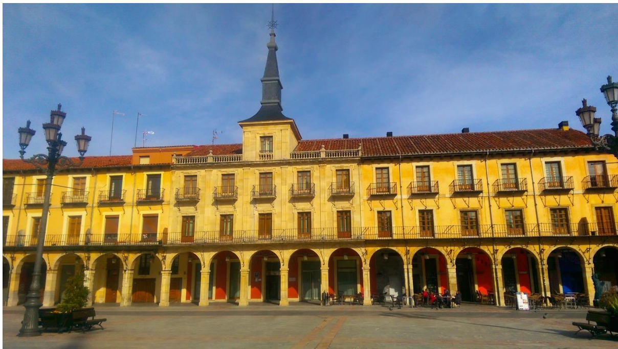
Plaza Mayor, León and the NH Hotel

I chose León as a convenient place to stop for a night. I would have to change from rail to bus at that point and, as a historic city and provincial capital with a population of about 130,000 and the site of a major university it promised to live up to similar Spanish cities. Also, the first teacher who tried to teach me Spanish came from León and sang its praises.