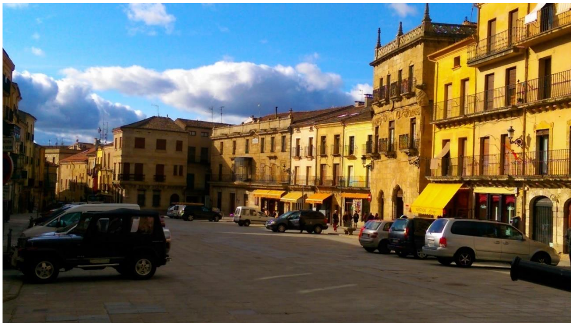
Plaza Mayor, Ciudad Rodrigo

There are a couple of café-bars next to the hotel and others on the square and in the surrounding streets so I had a wander round. Tonight's tapas included excellent stuffed peppers. On every bar television the investiture debate was coming to a conclusion and in the vote Pedro Sánchez was unsuccessful...so there will be another debate and vote in two days' time on Friday.