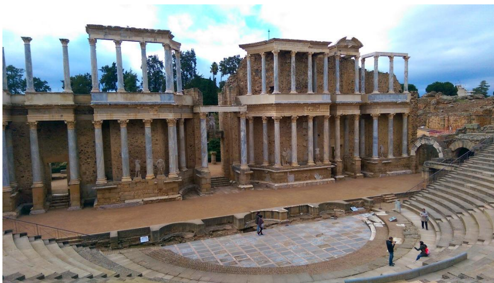
Mérida, Teatro Romano

By evening it has turned cloudy with some slight drizzle, but it is a Friday night and the streets are busy. I see from a Facebook post that it reached 29°C on the Costa del Sol today but it didn't manage to rise above 13°C in Mérida. In the middle of the Plaza de España there are four bar kiosks, one on each corner, so I follow the example of the locals and give each of them a try in turn. In three of them the tapita is olives and I'm all olived out by the end. There are no toilets in the kiosks, and I can't see any public ones on the square, so it becomes necessary to find somewhere indoors. The evening finishes in a bar close to the hotel. Inevitably, the second investiture debate and vote is on the television and, equally inevitably Sánchez still does not manage to get a majority – he manages to get one more vote than on Wednesday, from a Canarian deputy. So there is a two-month break for negotiations before the next attempt to form a Government (or to call new elections).