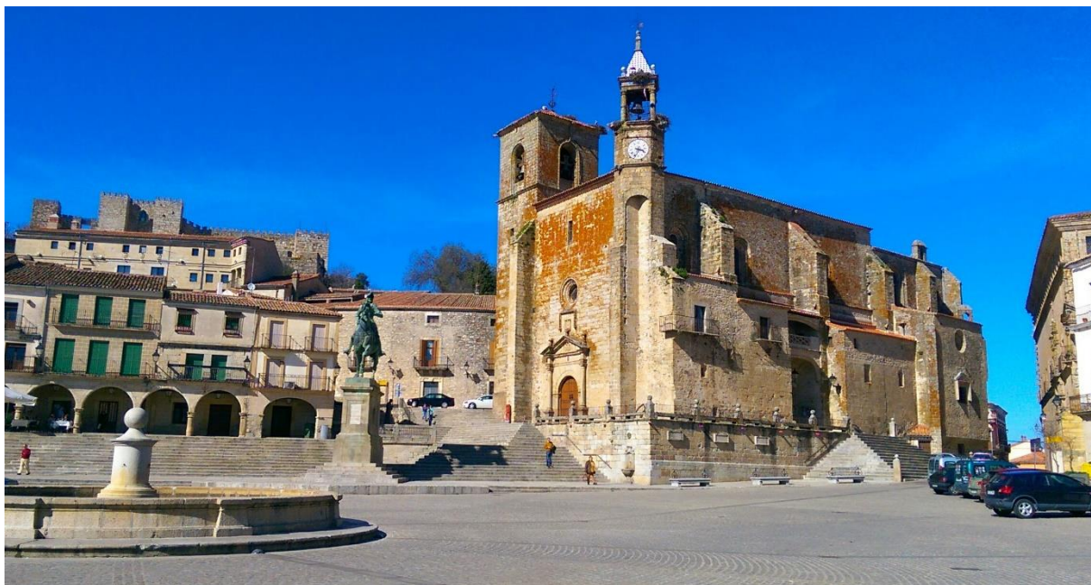
Plaza Mayor, Trujillo

From the bus station I make my way back into the modern town at the foot of the hill, then uphill to the historic centre around the Plaza Mayor. The square is extremely impressive with fine old buildings from the town's richest period in the sixteenth century. Above the square several churches, towers and the castle add to the view. I sit and have a beer outside a café (it is definitely warmer) and watch not a lot happen, though there is a caravan in the middle of the square, which looks decidedly out of place, with an exhibition of new technology, which attracts the occasional curious local.